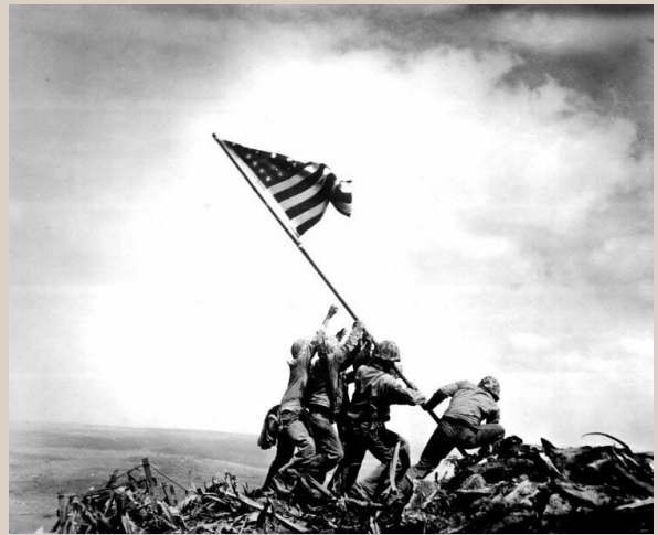
NAME EACH INDIVIDUAL REPRESENTED

If you want an old Corps photo featured here then email it to mystickcreature@msn.com or pictures can be collected at the meetings for scanning. Auxiliary members are also eligible to submit photos. Email your guesses to Meg at mystickcreature@msn.com