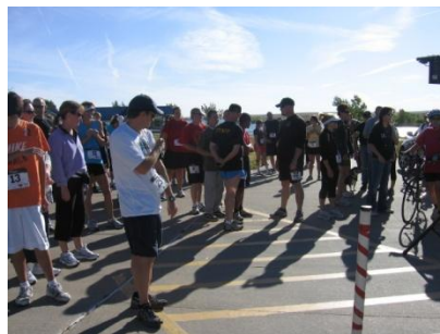
At the Ready (5k run/walk) – Starting Line