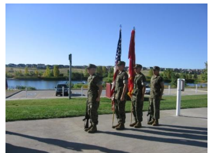
Adams City High School MJROTC Color Guard